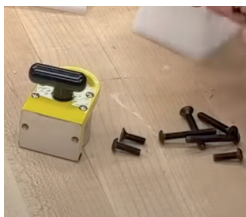
Hardware kit includes screws