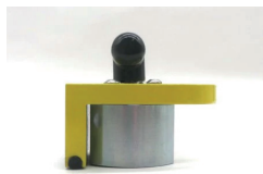
Holds flat and round surfaces of steel