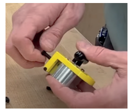
Designed with screw holes

MAGSWITCH TECHNOLOGY INC. | 1000 S. McCaslin Blvd. | Suite 301 | Superior | Colorado 80027 | United States | +1 (303) 468.0662 | sales@magswitch.com